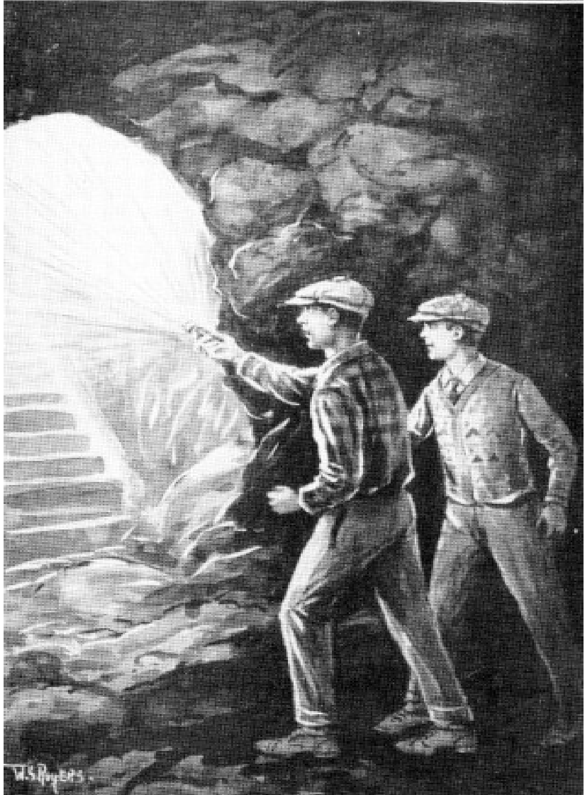
“We've found the passage!”